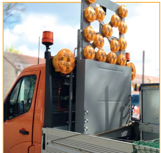
Vertical Lift system

Subject to technical modifications. For supply of these and many other Nissen products please contact Nissen UK Limited.