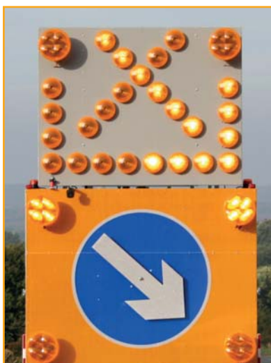
LP 8000 Light Arrow