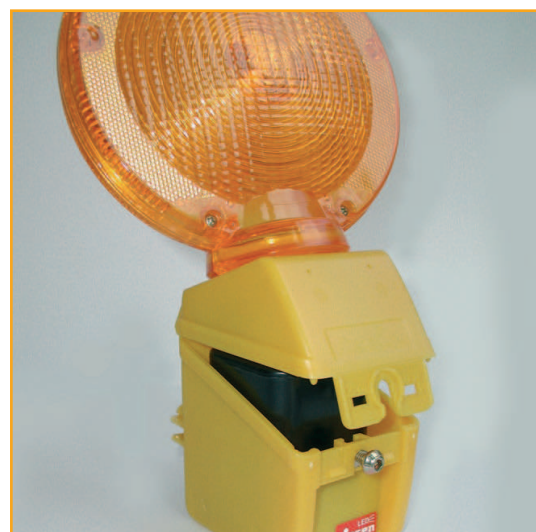
with new robust locking system

With only one Konstant 25 battery and with constant brightness, an operating time of 3.800 hours (320 days) flashing light or 950 hours (80 days) continuous light is obtained.