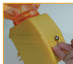
Open using NiKo key

12 lamps c/w plastic cone bracket in one carton / 240 lamps on one pallet