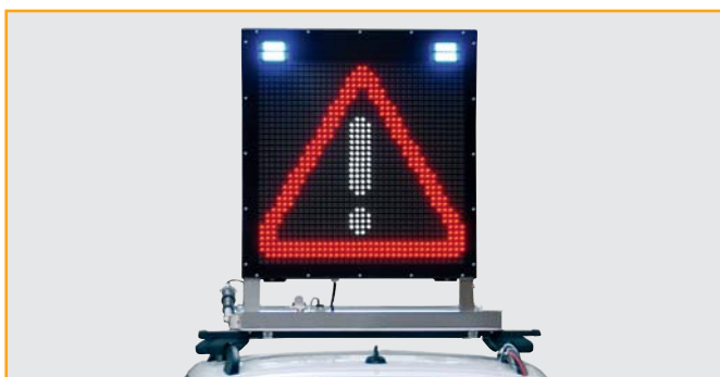
WeNiPol II (example)