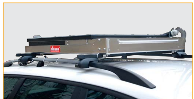
WeNiPol II lowered