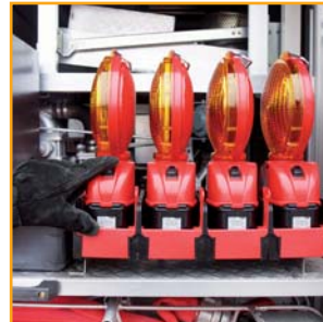
2. Switching on / synchronization

The Star-Flash LED Typ 627 can be operated as guide light system with any number of lamps. The support feet can be swivelled out for stable stand, e.g. in the air stream of passing vehicles ( stand space 255 x 235 mm ).