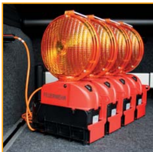
3. Charging in the vehicle

Quickstart: For switching on the unit only the first lamp in the charging cradle must be switched on. The other lamps are following automatically. The synchronization of the light sequence is carried out by infrared diodes.