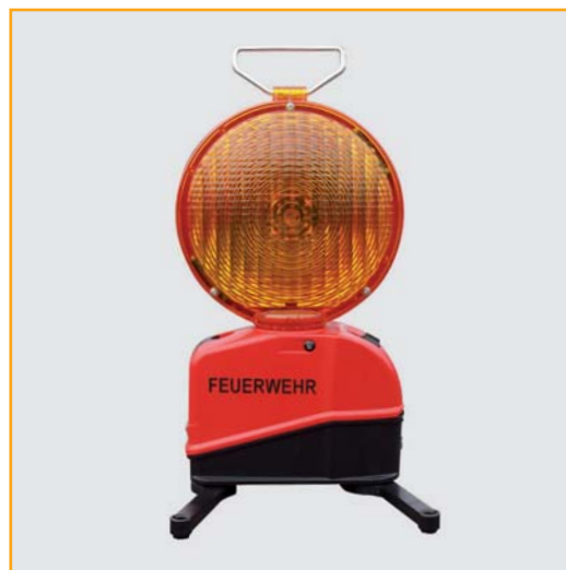
Guide light lamp