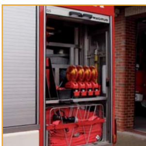
5. In the emergency vehicle

The 4-fold unit including cradles require a space of only 0,1 m 2 . The single lamps are „lightweights“ with approx. 1,8 kg including battery pack.