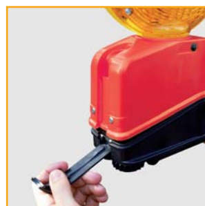
8. Robust quick lock

The text on both sides of the lamps is retroreflecting and gives an additional warning, e.g. when it is illuminated by the headlights of a car. At daylight the text is black.