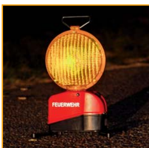
7. Retroreflecting text

Beneath the lens at the upper right edge of the lamp there is an LED status indicator . It indicates the on and off function and the charging status.