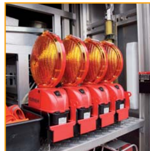
4. Low space requirements

To charge the batteries in the vehicle the cradles with the lamps inside are connected with the vehicle socket. (charging voltage 12-30 V). Operating time is approx. 70 hours.