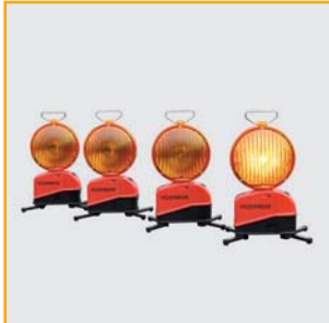
1. Operation as 4-fold unit

The Star-Flash LED Typ 627 can be operated as guide light system with any number of lamps. The support feet can be swivelled out for stable stand, e.g. in the air stream of passing vehicles ( stand space 255 x 235 mm ).