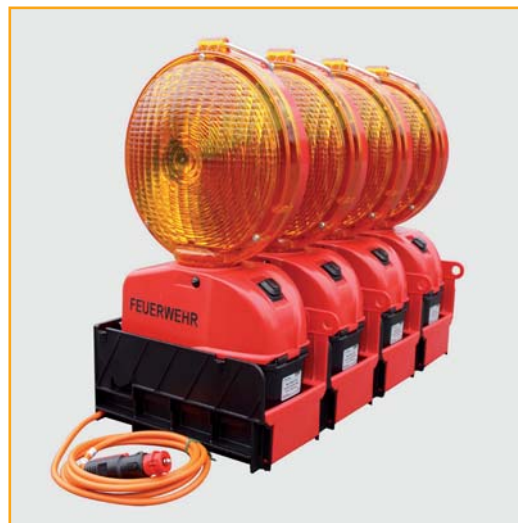
4-fold unit in charging cradle