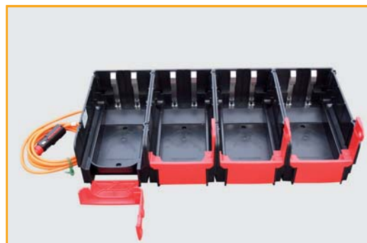
4-fold transport and charging cradle