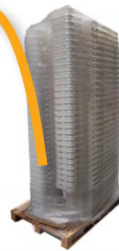
White New Jersey Plastic Barriers – palletized

The New Jersey Plastic Barriers are easily stacked into each other and therefore 4 times less storage and transport space will be needed than with conventional systems. 30 barriers will fit on one pallet.