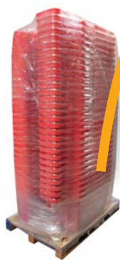
Red New Jersey Plastic Barriers – palletized