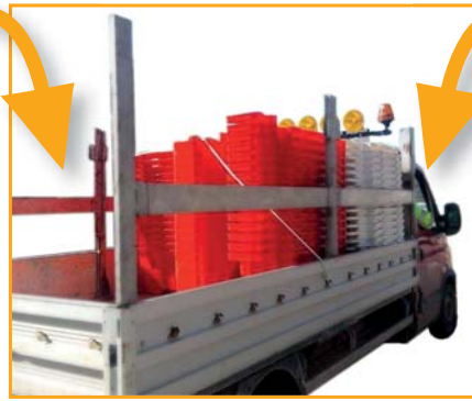
Up to 990 barriers per truck